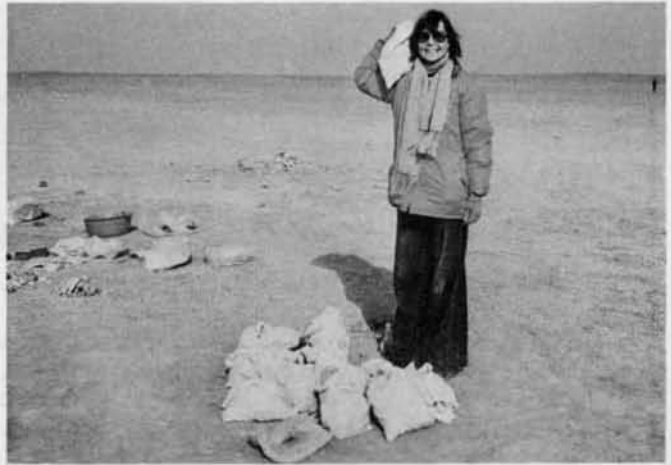
"Why is this woman smiling?" Actually I'm gathering the potsherds for my survey.

Thanksgiving Day was the most memorable any of us will ever spend. We took a motor boat deep into the marshes where little canals branched out from the main